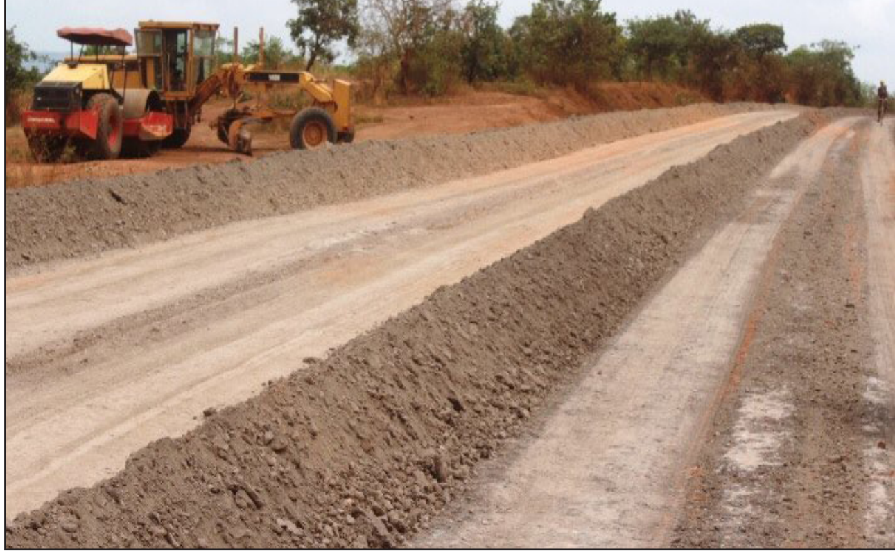
Lusahunga-Rusumo road construction in progress

Residents in communities around projects may be engaged to supply goods, or provide services on minor works.